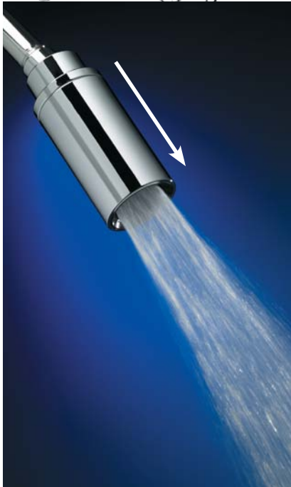
Concentrated spray rinse flow with heavier droplets

Featuring a Nominal Flow Rate of 1.5gpm/5.7L at 80 psi