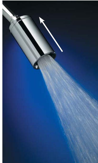
Wide spray pattern for maximum coverage

Caroma® Flow Showerhead incorporates a precision engineered nozzle that pressurizes water to produce a uniform spray of soft water droplets, maximizing comfort while saving up to 10 gallons more water than the standard 2.5gpm showerhead.*